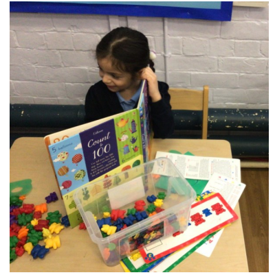
Number and shapes.