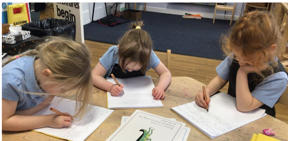
Phonics and writing.