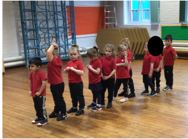
Squiggle Whilst You Wiggle.