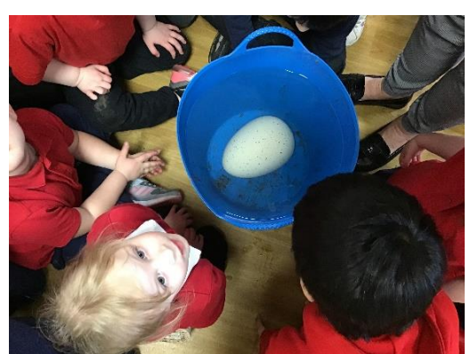
"Children are powerful learners. Every child can make progress in their learning, with the right help."